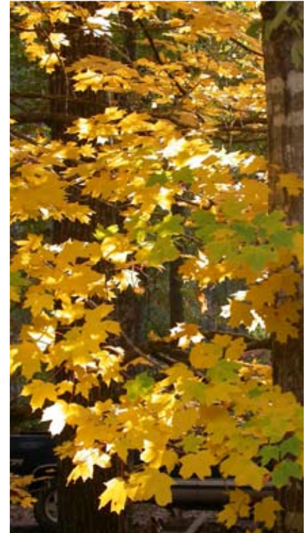
Some plants perform well with only occasional irrigation.