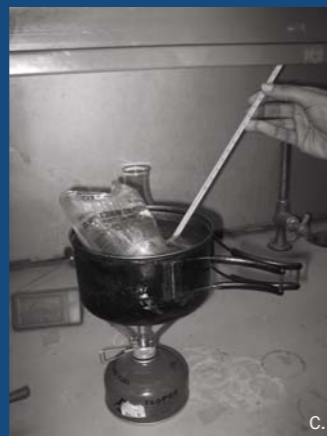
Figure 1. Pictures showing (A.) intravenous fluid bag with heat pack attached, a coil of intravenous tubing is between the heat pack and the intravenous fluid bag, (B.) intravenous fluid bag with coil, heat pack, and insulating fleece jacket attached, ready for infusion, (C.) 500 mL bag of fluid on stove with temperature probe on bag.