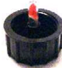
Orange wax in a sealed glass cylinder (WAPI) fits