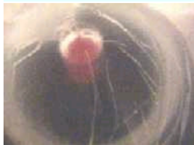
Orange wax indicator as viewed through bubble insulation. When orange color disappears, the required temperature has been reached.